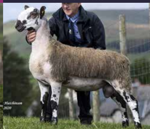
N4 Hewgill from Messrs Lord sold for £10,000 to P Teasdale, Alnwick & W&PF Walton, Hexham - sire L7 Riddings