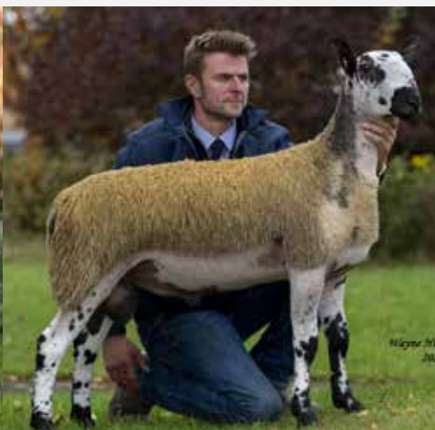
Granville & Paul Fairburn sold N28 Marriforth for £6,000 to D Hall, Firth – sire M4 Greenriggs