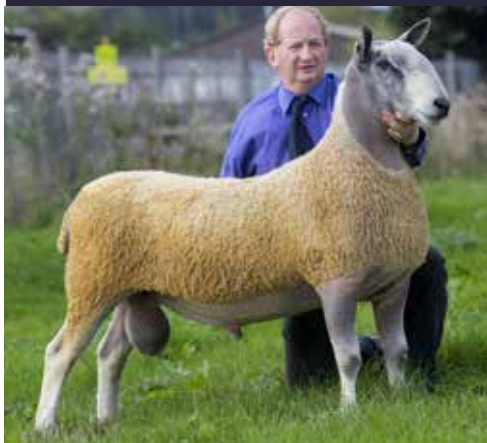
M & E Drummond sold M014 Cassington for £4,200 to Hindmarsh Partners – sire H27 Gornal.

Full sale report available at www.blueleicester.co.uk