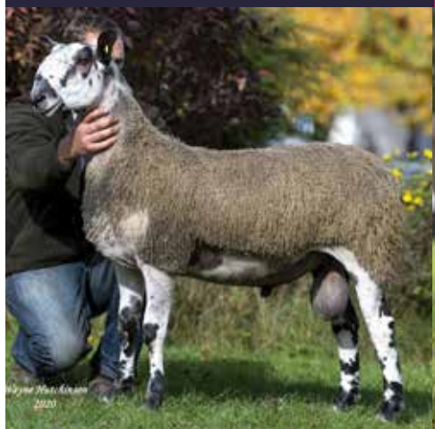
Ian Craig sold N1 Hanging Wells for £5,000 to Brood Ltd, Redditch – sire M1 Hanging Wells