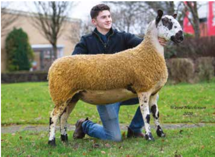
Supreme Champion from Midlock sold for 6500gns