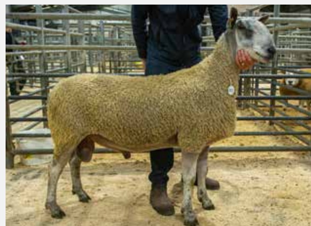
Top price at Hexham from TL Forster & Son sold for £800 – sire K1 Whinnyhall.