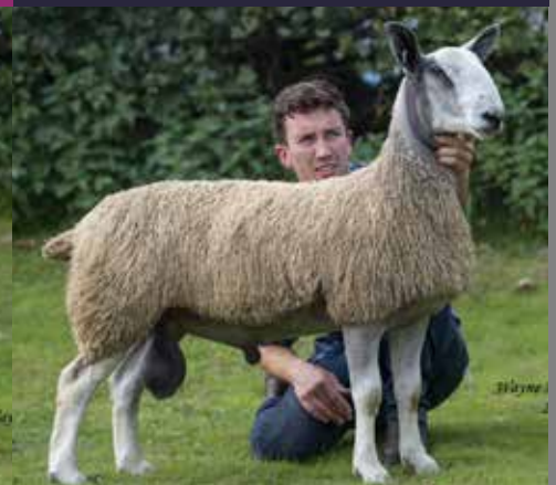
E Owen sold N1 Cernyw for 3000gns to Scott Thomason, Piel View - sire C10 Cernyw.