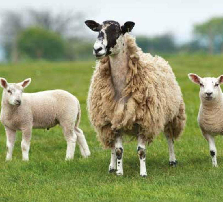
North of England Mule