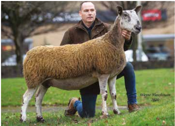
Top Priced Aged Ewe, J38 Highberries from N Marston, sold for 3000gns