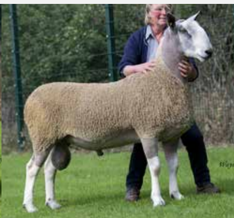
M3 Leadburnlea from Hazel Brown sold for £5,200 to A McClymont, Kirkstead – sire K30 Bonvilston 'Tudor'.