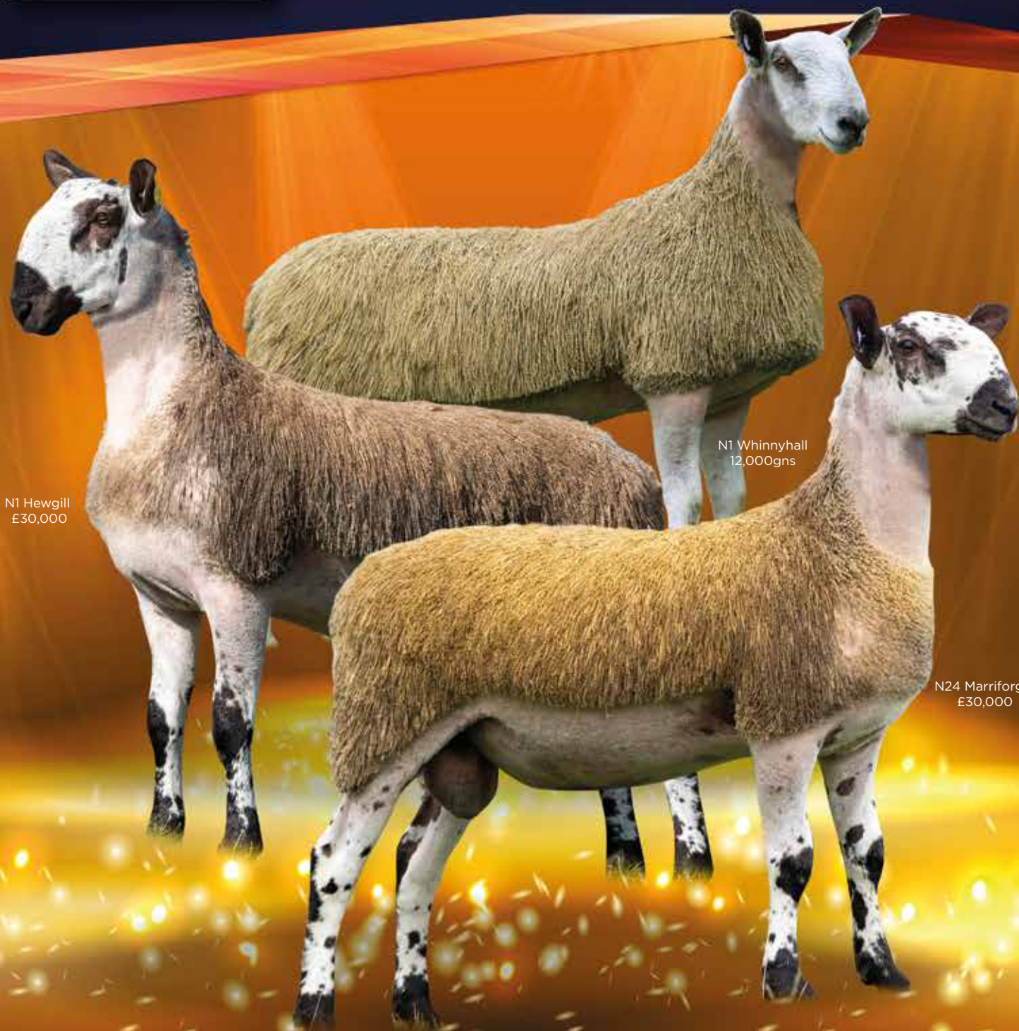
N1 Hewgill £30,000