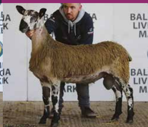
N3 Drummuck from Dominic McCrystal sold for 12,000gns to A Porter & M Wright - sire - M2 Tievebuaile Farm.