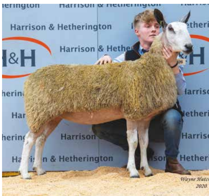
Top Priced L49 Holmview from Kirkstead, sold for 1600gns

Top of the pile was a gimmer shearling from the Kirkstead flock, which really is in a great seam of form at the moment, with a cracking pen of sheep, attracting much attention. This sharp gimmer was by the K1 Middle Dukesfield out of a homebred ewe by the G1 Craig Yr Orsedd, carrying twins