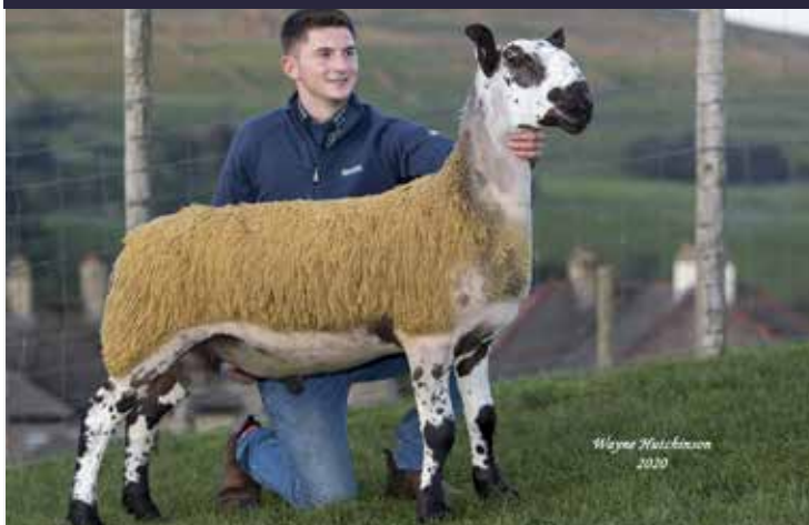
N1 Midlock from Allan & Ben Wight sold for £26,000 to E Fairburn & Sons, Marriforth – sire M1 Riddings