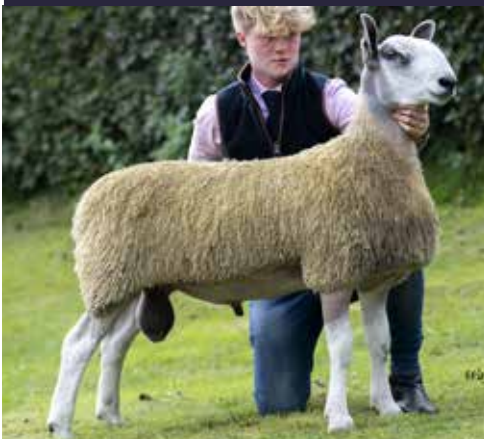
N1 Kirkstead, full brother to N2 sold for 3000gns to G Ogden, Blackrack - sire L1 Ashes.