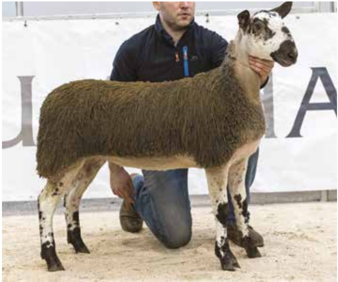
Top Ewe Lamb from A Macgregor sold for 4500gns